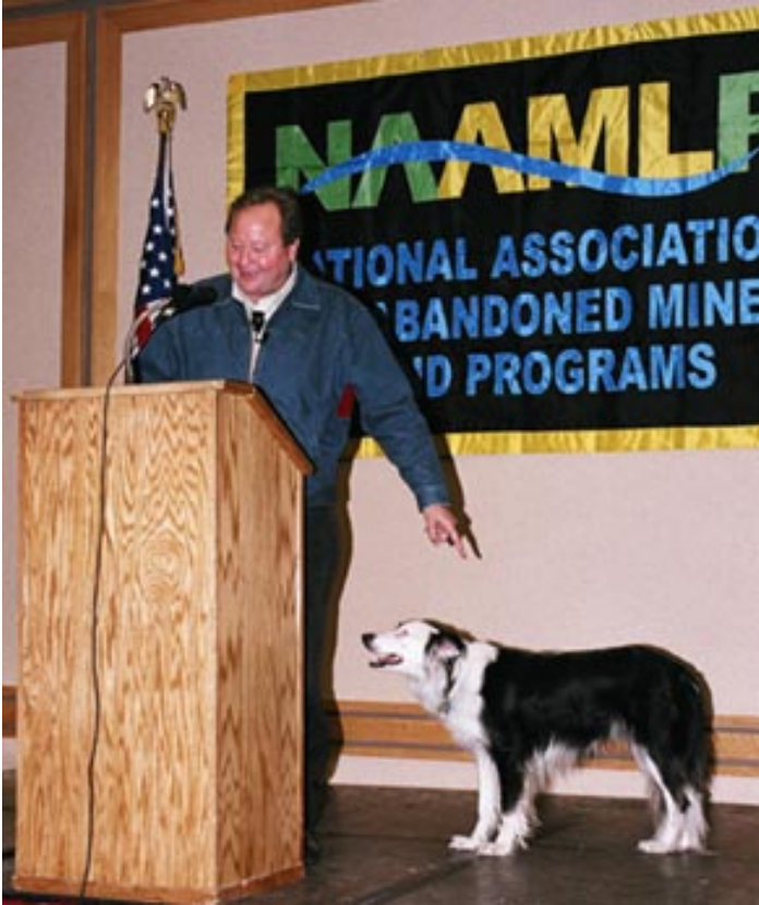
Montana Governor Brian Schweitzer and his dog Jag. Keynote address, September 25.