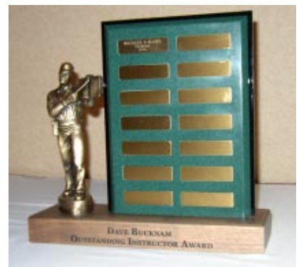
Dave Bucknam Award