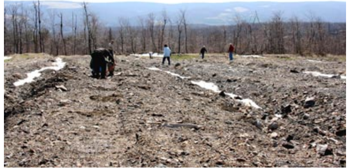
Arbor Day Tree Planting, April 2006

The goal of the demonstration project is not to provide scientific data but rather provide a site that will visually demonstrate