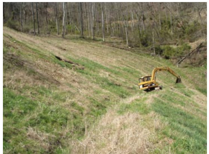
Octavia Church Refuse post-reclamation.