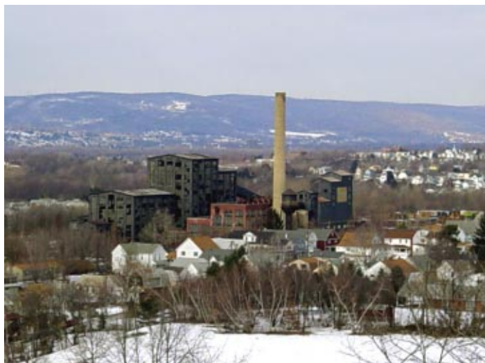
Cranberry Ridge AML Project, Hazelton PA