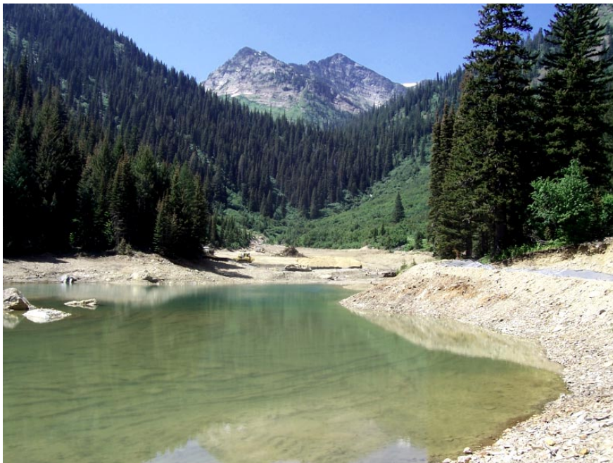
Reclaimed Snowshoe Mine in Montana, late summer 2009.

"Completion of this project should improve water quality in Snowshoe Creek and reduce the overall risk to human health and the environment posed by heavy metals," says Opp.