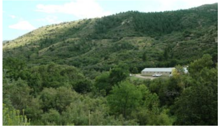
One year after reclamation in 2006, the gob piles are barely discernable.

Costs have been high, given the amount of hand labor involved and the difficulty of access for men, equipment and materials. Construction costs for the 22 acres treated to date total $3.5 million. This is more than $160,000 per acre of gob reclaimed.