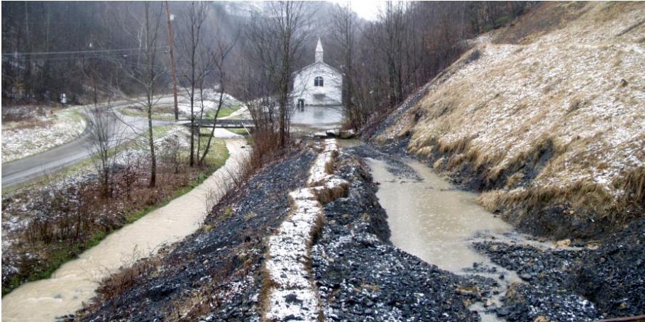
Octavia Church Refuse pre-reclamation.

Kentucky Division of Abandoned Mine Lands (AML) enhancement rule projects are a special type of reclamation project focused on reclaiming abandoned mine lands that, otherwise, have little likelihood of being reclaimed. These projects allow AML contractors to remove coal refuse and slurry from abandoned mine sites and to sell reprocessed coal in order to offset costs of projects. Usually, coal refuse is dry excavated and mixed with water into slurry, or dredged out wet, and hauled to coal processing facilities for recovery. Abandoned mine sites are then restored to their approximate original appearance by grading available topsoil and then planting grasses and ground covers. After projects are completed, hardwood tree seedlings are planted in the springtime on the reclaimed sites.