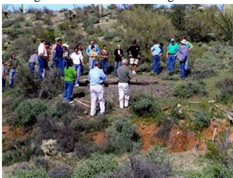
Field Trip - abandoned mine opening.

The field trip successfully showcased abandoned and current mining in Arizona and revealed strategies for reclamation. The Association is grateful to the Navajo AML program for assembling and hosting the 2008 Winter Meeting.