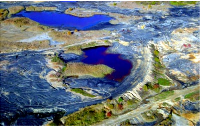
Aerial view of the Panther Tipple site.

The rolling land changes from green to brown and black leading up at the former coal mine and site for Green Coal Co. in the community of Panther on Kentucky 554 in Daviess County, south west of Owensboro.