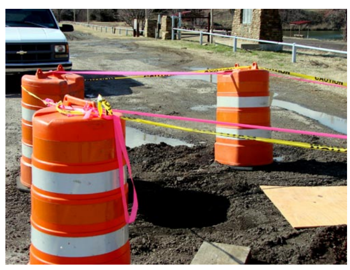
McCurtain Park Sinkhole

A sinkhole opened in the parking area of the McCurtain City Park a quarter mile west of the town of McCurtain (population - 466). The park is on State Highway 31 and is heavily used by the public because there is a water-filled strip pit that is a part of the park. Underground mining preceded the strip mining many years ago. The sinkhole was 4 feet in diameter and 11 feet deep. The sinkhole was reclaimed at a total cost of $7,919.20.