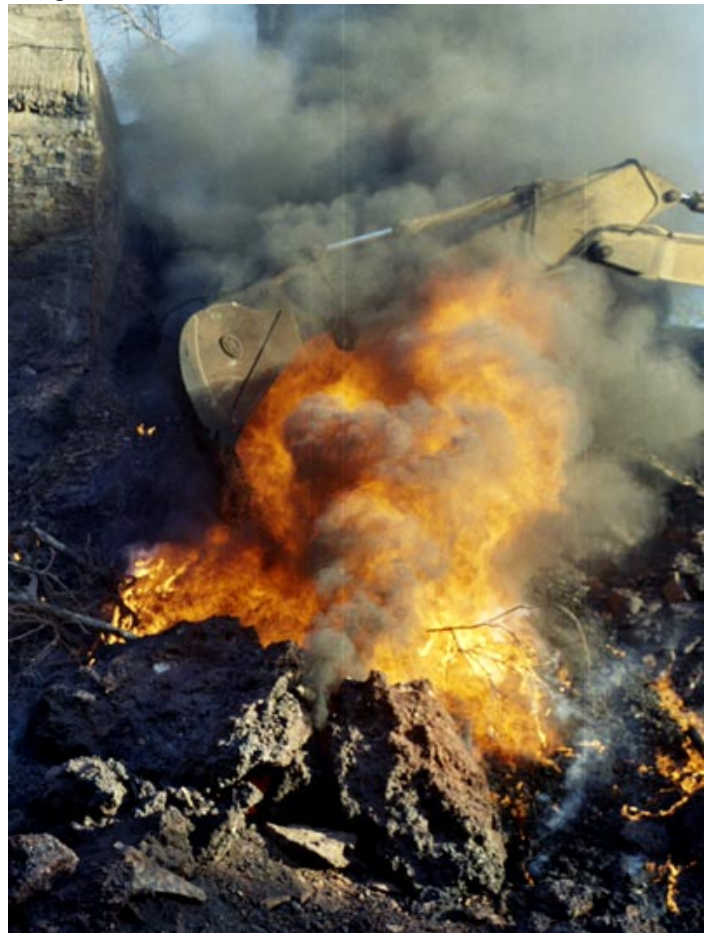
COE - Irwin Emergency

Eight days after completion of the work, the area received a small rain. After the rain, the gob fire became active at the top of the bluff. Equipment was brought back to the job site, and the hot spots were excavated into 2-foot piles. The piles burned out in three days. A 1-inch rain fell on the site three days later ending all fire activity. The area was then smoothed and blended into the contour of the bluff. Hay bales were installed for erosion control along the toe of the work area.