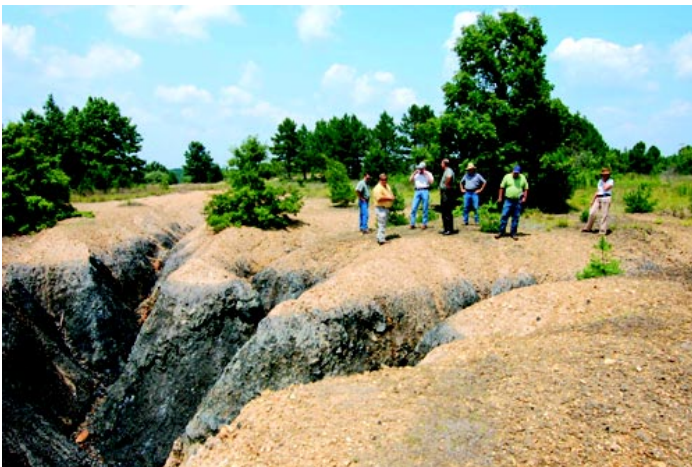
Steep, unstable banks are a hazard to hikers and cause acid mine drainage in streams at the Rocky Fork Conservation Area.

The ongoing reclamation project includes the grading of approximately 27 acres of exposed mine waste and gob material at the old tippie site and loadout facility to a gentle slope. The mine wastes are extremely acidic, so large quantities of agricultural lime will be applied and incorporated into the graded area. Following lime application, the area will be covered with 2 to 3 ft. of good quality glacial-till overburden borrowed from a nearby 9-acre mine spoil ridge. Additionally, a 5-acre eroding portion of the slurry pond will be reclaimed by grading, incorporating lime and covering with glacial-till overburden. Limestone armored drop-down structures will be installed to control erosion and improve the long-term stability of the slurry pond. All affected areas will be revegetated. Three acid wetland areas, totaling one acre, will be reconstructed or enhanced. The wetlands will be surface treated with calcium carbonate in the form of agricultural lime and covered with organic matter obtained from the City of Columbia's compost facility. Two small acid ponds, not directly associated with the earthmoving activities, will also be neutralized under this project.