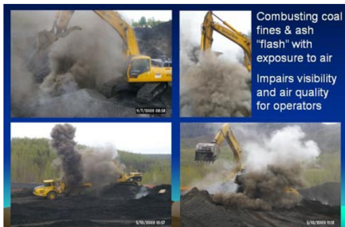
Construction Encounters Hot Spots

Phase II Methodology: The contractor on this phase opted to cut trenches up to one and a half meters in depth across the surface of the refuse piles using crawler tractors – in this instance a D-8R and a D-10T. Each trench was then flooded with water from an off-road tank truck using water from Slipper Lake and allowed to soak into the surface until the trench was cooled down to the level required. Once cooled the trench was dug down until the temperatures again rose above the threshold mark as determined by hand held infrared thermometers. The material pushed out of the trench onto already cooled ground was then compacted to over 90% by the passage of both water trucks and bulldozers. After the entire phase area was completed in this manner, a clay cap was also spread over it similarly to what was done in Phase I. This phase of 26 acres with depths of 70 feet was done in four months of one field season without any reports of noxious odors down-wind of the project.