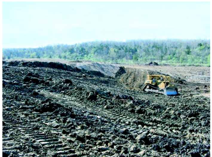
The gob pile will be graded to gentle slopes that minimize erosion and prevent the redevelopment of gullies. The sub-grade coal waste will then be treated with ag-lime and covered with 2 to 3 ft. of good quality glacial-till soil.

C. L. Richardson Construction Company, of Ashland, Missouri is performing the construction work. The contract amount is $913,086.45. The Rocky Fork Project is a relatively long-term cooperative effort between LRP and the Missouri Department of Conservation (MDC). LRP will be responsible for seeing the project through construction and subsequent green mature plantings. MDC will be responsible for selecting the permanent warm-season grass mixture and assisting with tree planting recommendations. LRP will supply the revegetation materials and MDC will provide their expertise, equipment and labor for planting the final, permanent vegetation.