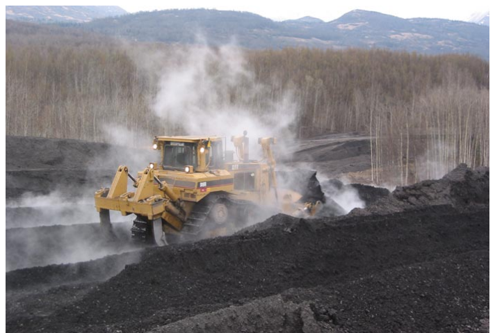
Figure 2 Jonesville Fire Phase II - Cat pushes trenches into hot refuse

General Project Data: The entire area was drilled to determine temperatures and verify the existence or absence of voids so we could provide the operator with some indication of what the conditions were that they would encounter. No large voids were found in any of the drill holes and temperatures varied widely. The Phase II area showed higher temperatures than did Phase I. The goal of the project was to dig out 100% of the refuse piles down to native ground to insure the fire was completely out, cool off all