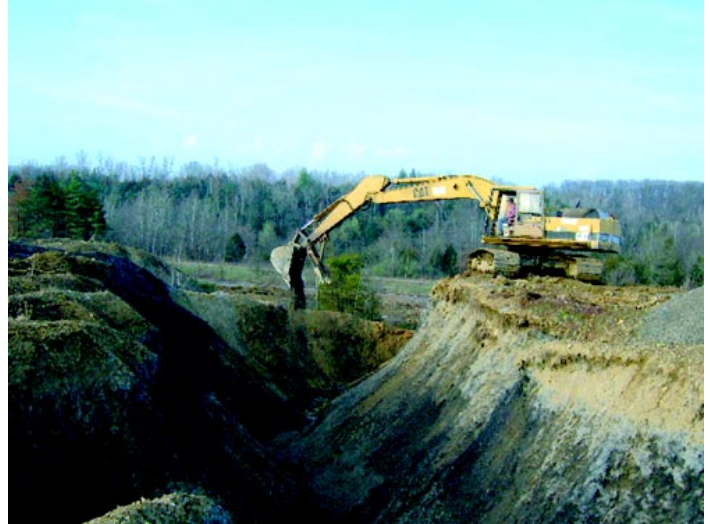
The trackhoe is placing agricultural limestone to neutralize acidic coal wastes prior to grading the gob pile. This preventative treatment measure is being taken because ravines like these often act as conduits for acid water seeps, even after the site is graded.