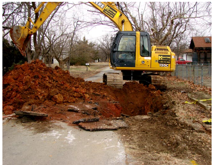
Ute Street Emergency

Mark’s Construction, LLC, was the low bidder. City officials alerted the OCC and the contractor that there were two 4-inch service sewer lines and one 8-inch clay tile main sewer line inside the sinkhole. First, the contractor excavated all of the soft dirt. He then stabilized the bottom of the excavated area with clay, 4-inch rock, and small gravel. All three sewer lines that were disturbed were replaced. The contractor then packed the sinkhole area up to the surface and prepared it for asphalt. The city provided the asphalt and the contractor assisted the city work crew in laying the asphalt. The total cost was $3,231.80.