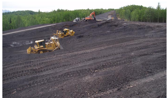
Figure 3 Mass production to prepare trenches for water flooding.

Phase II Methodology: The contractor on this phase opted to cut trenches up to one and a half meters in depth across the surface of the refuse piles using crawler tractors – in this instance a D-8R and a D-10T. Each trench was then flooded with water from an off-road tank truck using water from Slipper Lake and allowed to soak into the surface until the trench was cooled down to the level required. Once cooled the trench was dug down until the temperatures again rose above the threshold mark as determined by hand held infrared thermometers. The material pushed out of the trench onto already cooled ground was then compacted to over 90% by the passage of both water trucks and bulldozers. After the entire phase area was completed in this manner, a clay cap was also spread over it similarly to what was done in Phase I. This phase of 26 acres with depths of 70 feet was done in four months of one field season without any reports of noxious odors down-wind of the project.