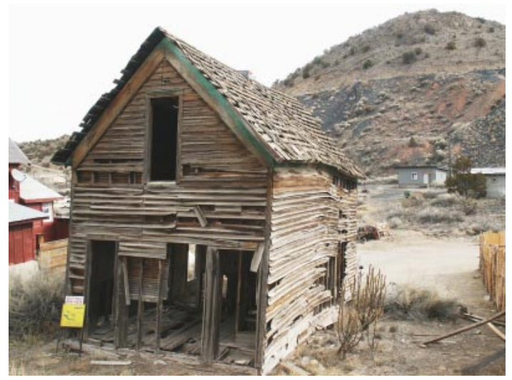
On the outskirts of town, some of the original company structures are waiting for some TLC. The original wood-frame cabins were dismantled in Kansas and brought to Madrid by train.

Since the 1980s, the New Mexico Abandoned Mine Land Program (NMAMLP) has safeguarded most of the hazardous abandoned coal mine openings at Madrid. The Program has also completed projects to control erosion, control subsidence, improve stormwater drainage and reclaim gob piles. Much of the townsite is built on or adjacent to coal gob piles, with associated problems including windblown dust, accelerated erosion and sedimentation, poor localized stormwater drainage and a destabilized stream system.