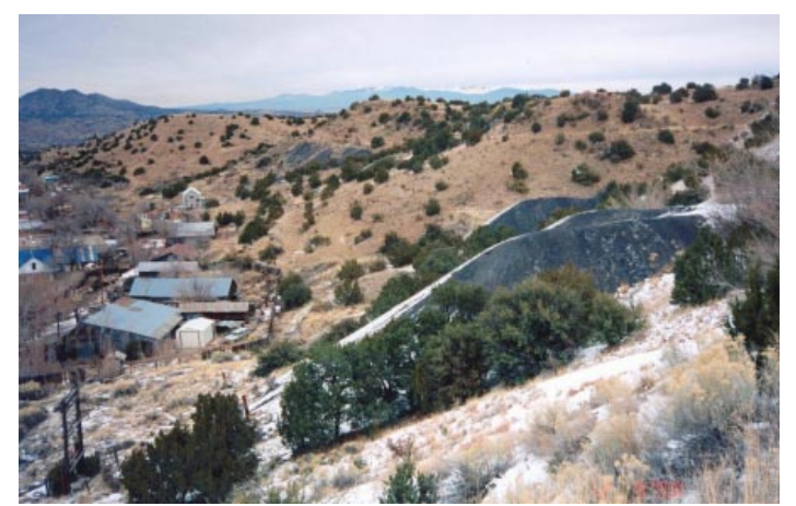
After several decades of exposure, gob piles remain without significant vegetation. The piles experience significant erosion off the steep slopes and sediment deposition onto flatter slopes and into drainages.

Multiple public meetings, including forums, focus groups, surveys and webpages, will be facilitated to allow public participation and comment on community plans and to insure that concerns, goals, aspirations and visions of landowners, residents, funding partners and other stakeholders are heard, noted and considered. The final planning summary report will detail community outreach efforts, identified issues and concerns, community preferences and priorities, and identification of specific problems to be addressed and their prioritization.