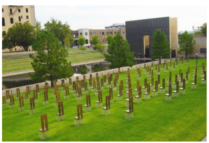
The Field of Empty Chairs, east Gate of Time, & Reflecting Pool at the Oklahoma City National Memorial.