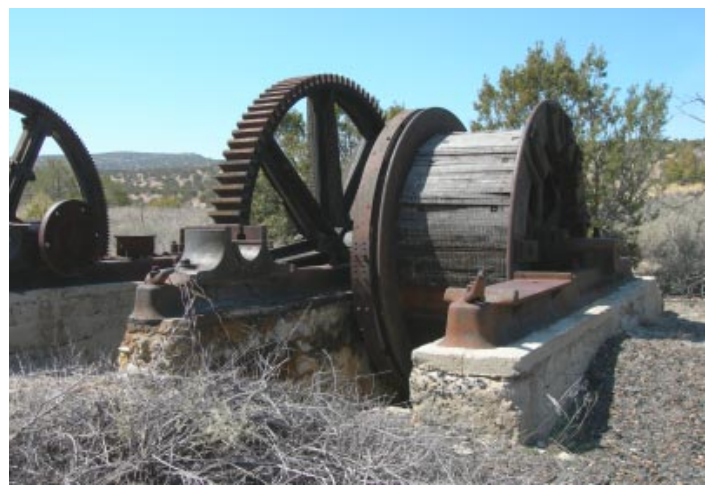
Old machinery and foundations, like the gears and pulleys from the original coal tram, dot the landscape in Madrid.

NMAMLP is currently evaluating proposals from planning, landscape architecture, and engineering firms to develop a community plan to prioritize and address problems arising from past coal mining practices in and near Madrid. NMAMLP is interested in exploring creative and innovative ways to address the impacts of historic coal mining at Madrid, while honoring its historic heritage and the goals and aspirations of the present community. The planning process will start with the identification of stakeholders; the development of baseline descriptions of the historical, social and physical aspects of the community; and the creation of an inventory of the problems associated with past mining practices, including public health and safety issues, physical dangers and degraded land, water, wildlife and recreational resources.